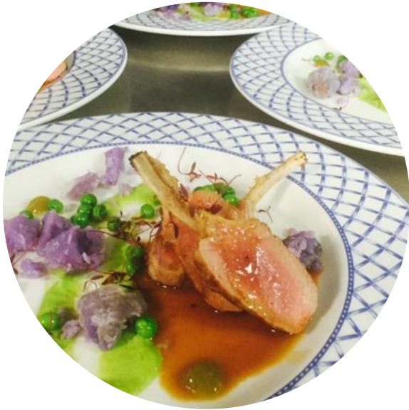
THE KITCHEN AT READING COLLEGE

Students are trained to a professional standard where they gain valuable work experience.